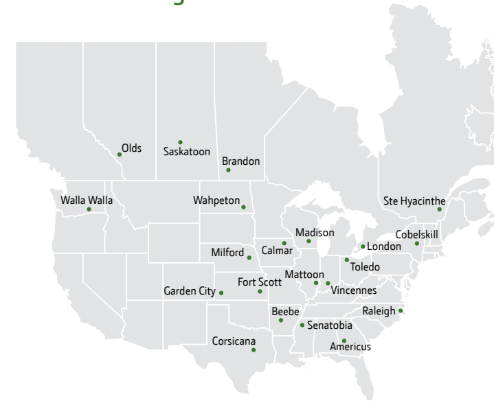
The John Deere TECH program is available at 21 locations.

The John Deere TECH program is an educational experience that will help you put your career in gear, and keep it moving.