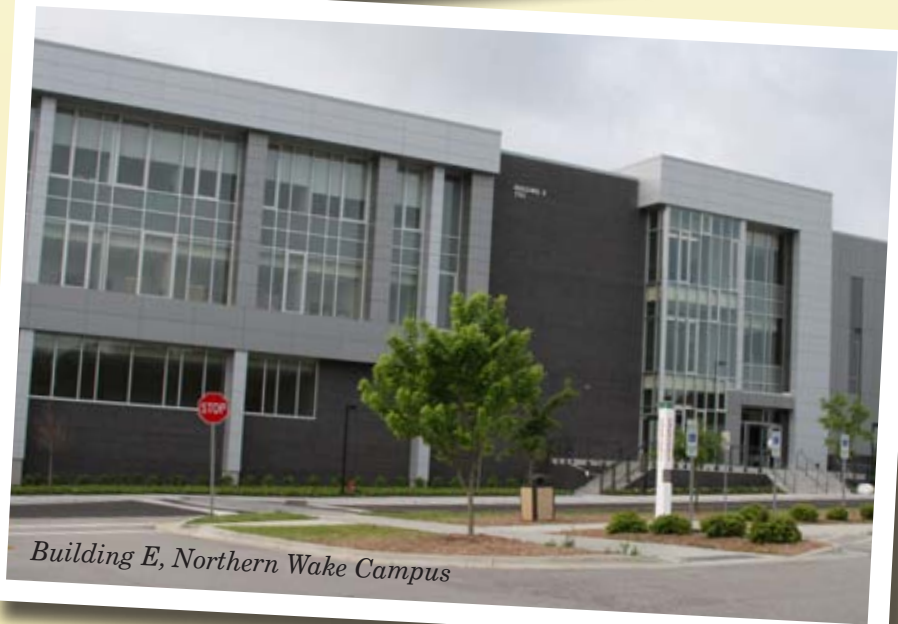
Building E, Northern Wake Campus

2901 Holston Lane, Raleigh | health.waketech.edu | 919-747-0400