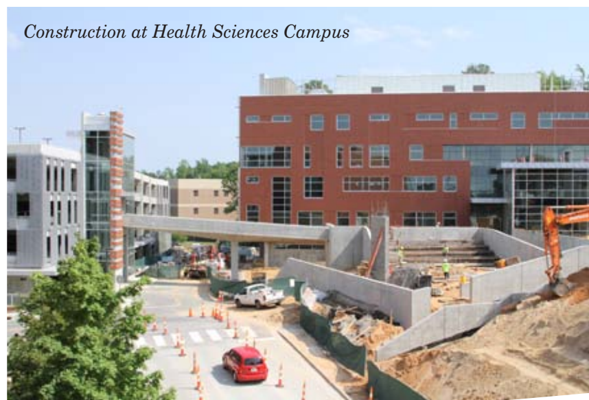
Construction at Health Sciences Campus